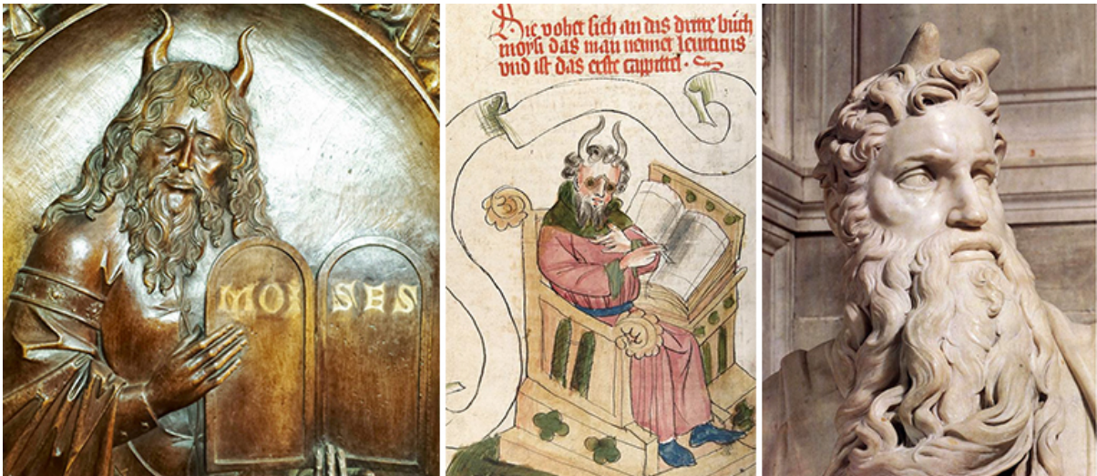
Oviedo Cathedral, Spain; Diebold Lauber biblical illustration; Michelangelo’s Moses

much art, from stained glass windows to Michelangelo’s famous sculpture for the tomb of Pope Julius II, placing it permanently into the culture. It also facilitated 1,600 years of anti-Semitism with the idea that Jews have horns and are touched by Satan.