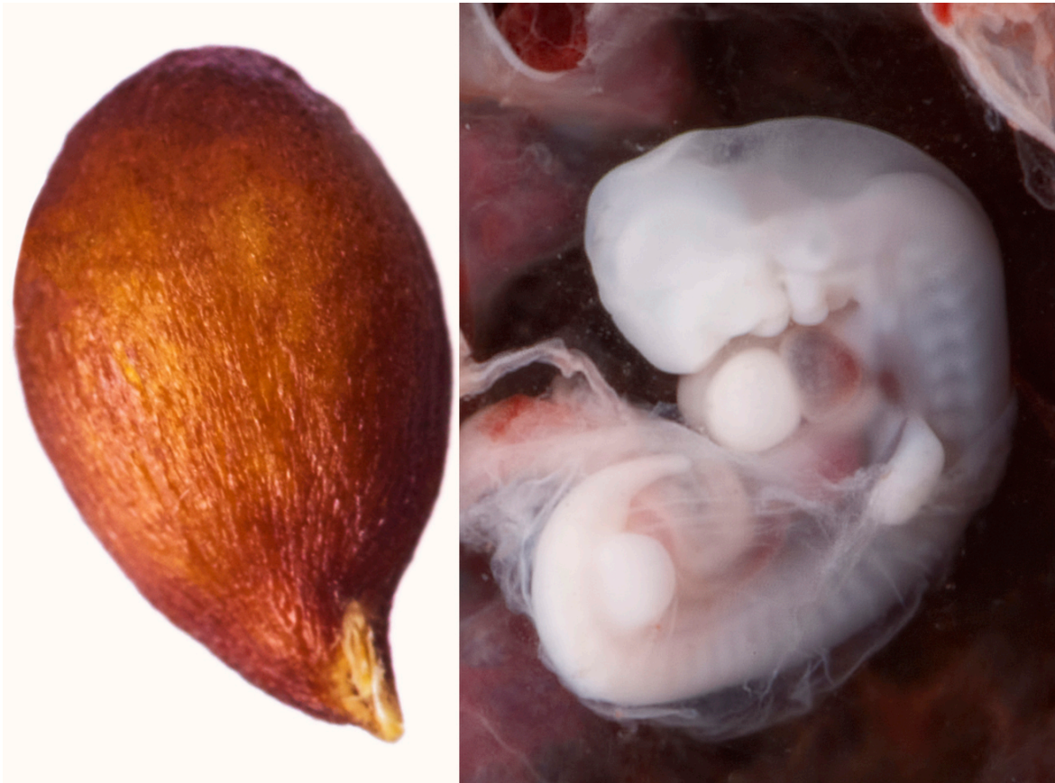
Apple seed; https://embryology.med.unsw.edu.au/embryology/index.php?curid=7298

At five weeks, the tiny tadpole-like embryo hasn't even grown to the size of an apple seed. It is made up of three layers — the ectoderm, the mesoderm, and the endoderm — which will later produce all of the organs and tissues. The brain, spinal cord, and nerves develop from the neural tube, which is starting to organize from the top layer — the ectoderm. The heart and circulatory system begin to take shape in the middle layer, or mesoderm, and the tiny heart begins to beat. The third layer, or endoderm, will become the lungs, intestines, and early urinary system, as well as the thyroid, liver, and pancreas. In the meantime, the primitive placenta and umbilical cord are already functioning, delivering nourishment and oxygen to the developing embryo. Is this what you picture when you consider that seed-sized “baby” at five weeks, likely still unknown to the woman yet now eligible under a “heartbeat law”?